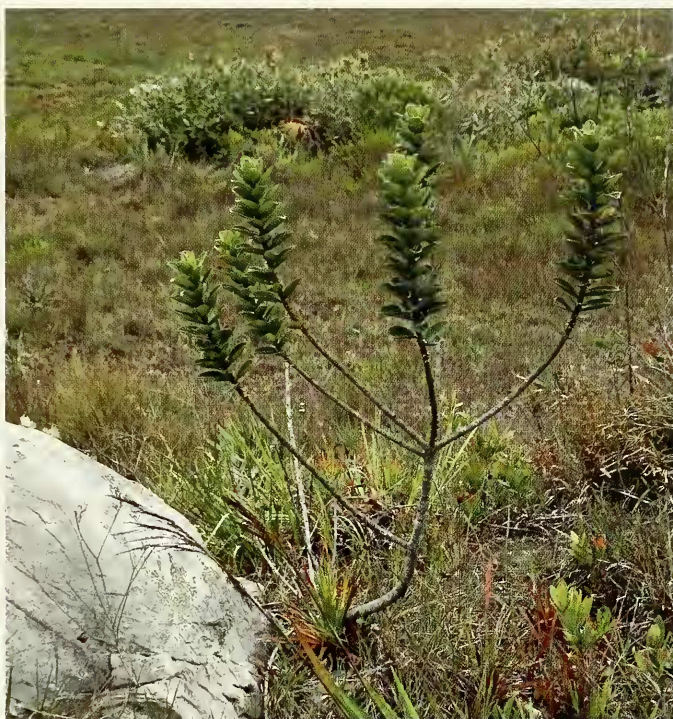
FIGURE 3. Symplocos candelabra Aranha, P.W. Fritsch, and Almeda showing habit and habitat.

Tree ca. 3 m tall, much-branched from the middle upward. Branchlets subquadrangular, dense-